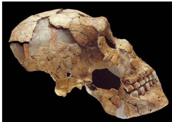
Fig. 1: Skull of a "more recent" representative of the Neanderthals, the Saint-Césaire (Dépt. Charante-maritime, France).